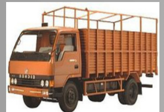
Eicher Canter 01 .