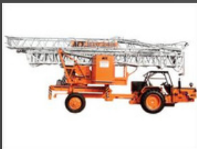
Mobile Crane 04 .