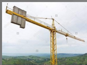
Tower Crane 01