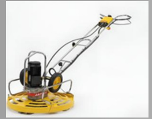
Vacuum Dewatering System 04