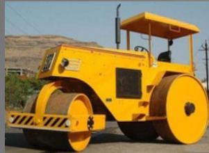
Road Roller: 2 Nos.