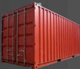
Store Container 10Nos