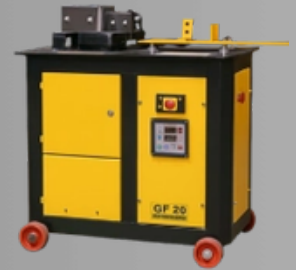
Cutting, Bending, Ring Machine 5Each