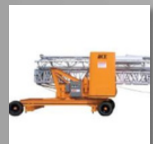
Alpha Crane: 02