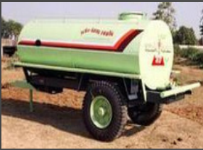
Water Tanker 02.