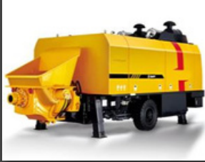
Concrete Pump 02 .