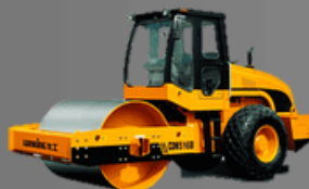
Vibro Roller 01 Nos.