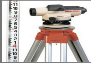
Auto Level 02