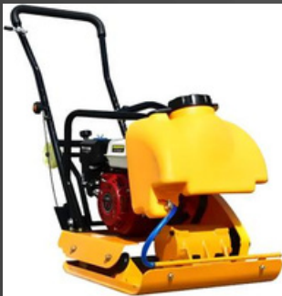
Earth Compactor 04