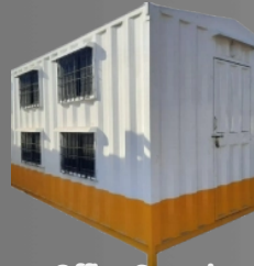
Office Container 6 Nos