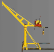
Monkey Crane 02