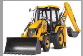
J.C.B. (Earth Mover) 02