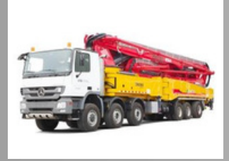
Boom Pump 02 .