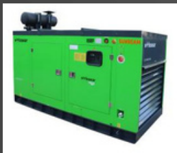
D.G. Set (125 K.V.A.) 05