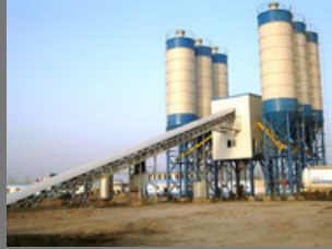
Batching Plant 1 Nos. 30 M 3